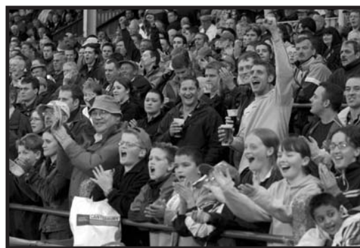
• Rugby fans at Ravenhill

Sinn Féin recognises the success of Ulster Rugby in recent years, and the increased popularity that this has brought with it. However, we believe that the Ulster branch of the IRFU must follow the example of their counterparts in Dublin. When Lansdowne Road was being redeveloped in Dublin, the Dublin