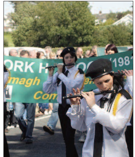
MARCH: Thousands gathered in South Armagh on August 14 to commemorate the 30th anniversary of the 1981 Hunger Strike