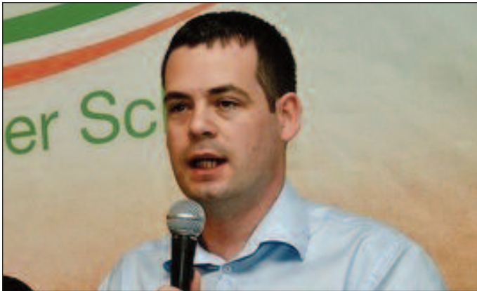
ECONOMIC SOVEREIGNTY: Sinn Féin TD Pearse Doherty