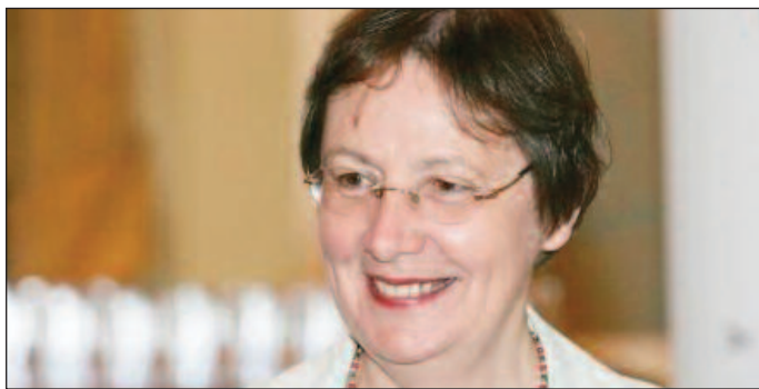
GREEN ENERGY FUTURE: Sinn Féin MEP Bairbre de Brún