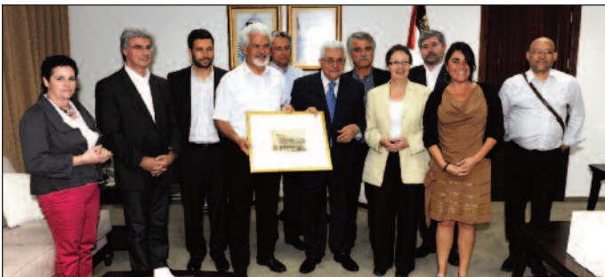
STATEHOOD: Bairbre de Brún and six other MEPs at the International Meeting in Jerusalem: Recognition of the Palestinian State

"A good starting point for the UN and the EU is to heed the advice of aid agencies operating in the region such as Concern, Trócaire and Oxfam Ireland as well as the many other heroic NGO volunteers on the ground."