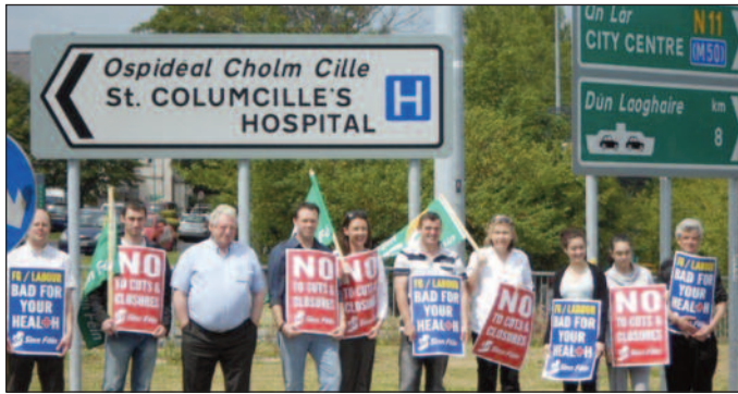
DAY OF ACTION: Sinn Féin activists hold a day of action in July against hospital closures and cuts to the health service