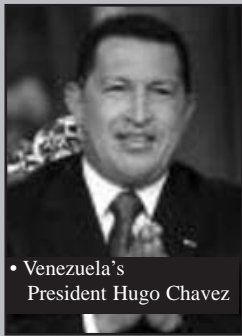
• Venezuela's President Hugo Chavez

The contribution of the housewife to society has remained largely hidden and unrecognised for centuries.